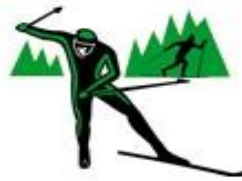
Cross Country Ski Shop Grayling